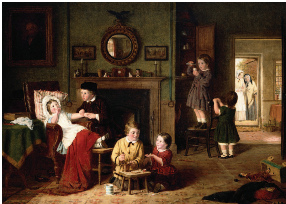
Fig. 1. Child's play is science. ["Playing Doctors" by Frederick Daniel Hardy (1827–1911); image: Stapleton Collection/Corbis]

The probabilistic models approach [e.g., (6–9)] addresses this dilemma in a new way. Imagine that there is some real structure in the world—a spatial configuration, a grammar, or a network of causal relationships. That structure gives rise